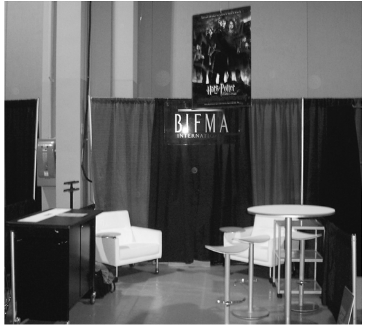
BIFMA Booth in Atlanta

The U.S. Green Building Council will bring this annual affair to Denver, Colorado in 2006.