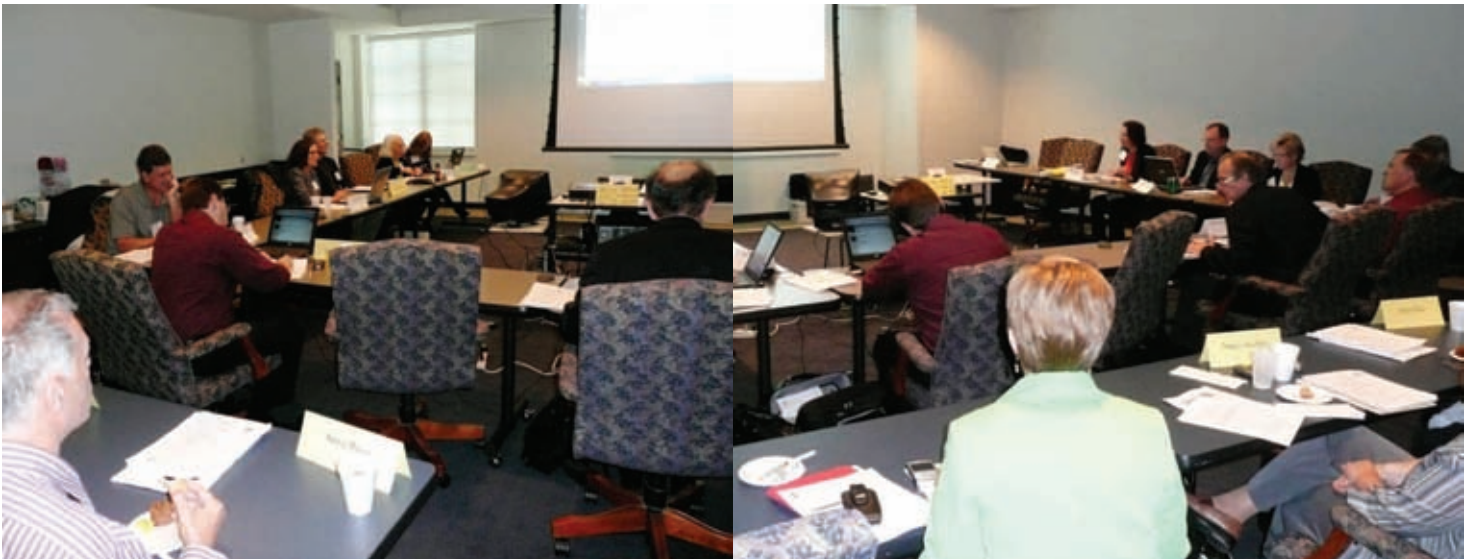
May 8, 2008 - Sustainability Assessment Standard stakeholders zero in on the final pieces of an ANSI standard for business and institutional furniture at the Joint Committee meeting in Ann Arbor, MI.

Minor refinements to the standard continue to be incorporated, all consistent with input from the ballot and comment period. It is expected that the standard will be released to the formal American National Standards Institute (ANSI) consensus vote in June. Concurrently, a 45-day open public comment period will also be initiated that provides an opportunity for any affected party to provide input on the standard. BIFMA, in cooperation with NSF and all the other stakeholders have utilized a very open process throughout the development of this sustainability standard. Though laborious at times, we believe the process has resulted in a credible, multi-faceted model of sustainable product evaluation that can easily be adapted to other industries.